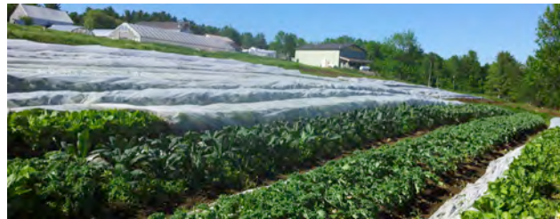
Organic kale thrives on Bahner Farm in Belmont, ME.

Organic farming in Maine has a unique face. Though increasing, acreage on organic farms in Maine currently averages 113 acres/farm compared to the national average of 260 acres/farm on organic farms viii . Maine's farms are largely family-scale operations focused on local and regional sales and adding value to their local communities. The priority of Maine's organic farming sector and the focus of MOFGA's educational programs is to strengthen the viability and market share of existing farms while training and assisting new farmers. MOFGA's new farmer training equips farmers with the skills and resources needed to be successful and provides links and other connections to help new farmers obtain the land they'll need to establish new farms.