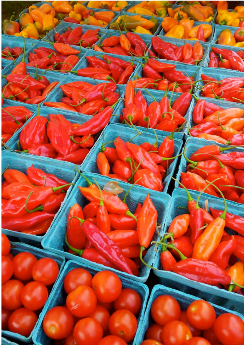
Fresh, organic tomatoes and peppers are a mainstay at the Bahner Farm market stand.

For 45 years, MOFGA has offered programs and services that attract new farmers to the state, keep young people in Maine to start farms, and provide critical skills, resources, and connections that help ensure long-term farm viability. Between 2007 and 2012 the number of beginning farmers nationwide dropped 20 percent. In contrast, the number of beginning farmers in Maine increased, bucking national trends and underscoring the value of the critical resources available in the state to successfully attract and support beginning farmers xi .