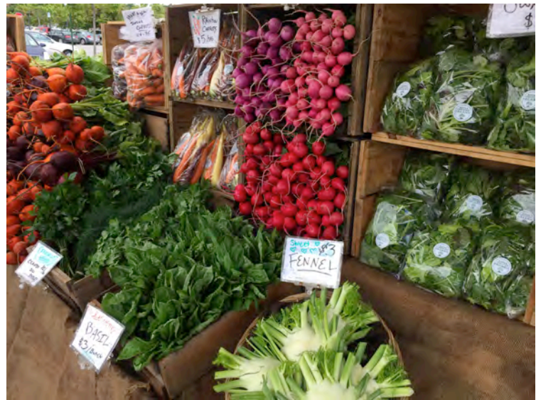
The farmers market stand of Fail Better Farm - Etna, ME

While early cohorts trained 5 to 10 farmers, more recent cohorts trained 15 to 25. This is significant as we examine data released in the 2014 USDA Organic Survey and note that Maine led the nation in new farm creation between 2008 and 2011. A total of 138 new certified and exempt organic farms were created during the period, an average of 23 new organic farms established each year viii .